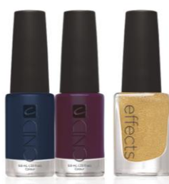
The Look: Fall/Winter 2011

May 2011 - This season's winning elongated, almond-shaped manicures unite French decadent gold leafing with velvet vamp shades of midnight sapphire, aubergine and burgundy for a Baroque meets day-wear feel. If you lack royal blood, opt for grungy, weathered earth tones washed with shimmer for textural dimension, or worn-in vintage manicures in peach, hazy violet and minty sage green.